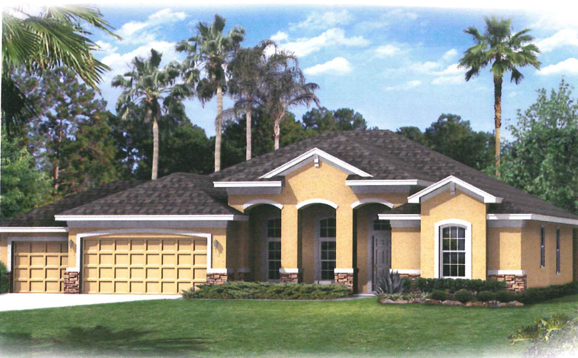
BROOKHAVEN II 3 CAR - ELEVATION B